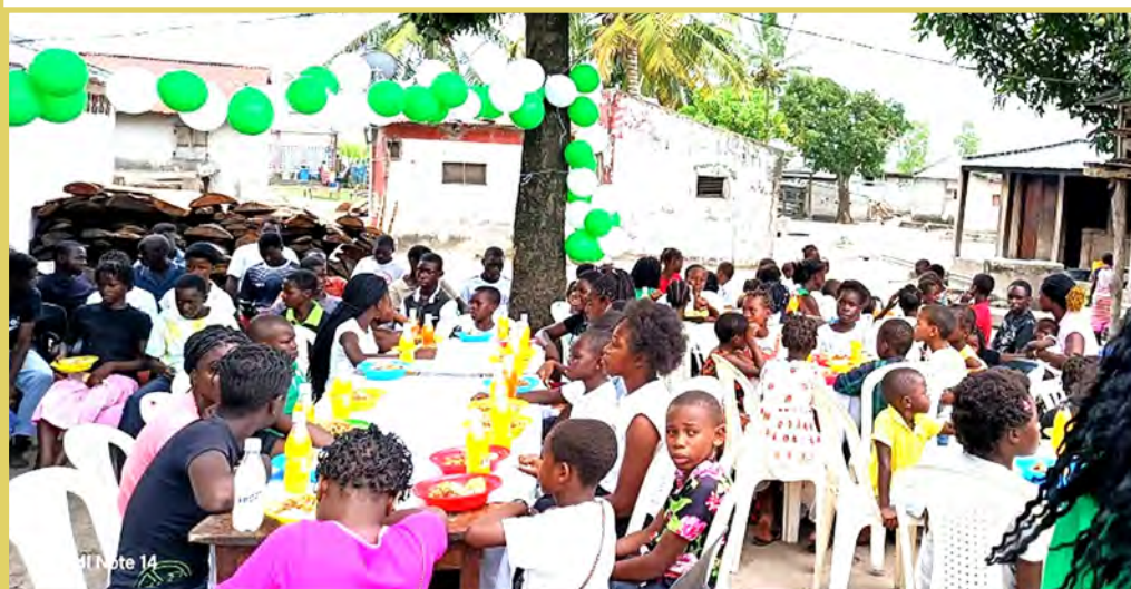
Christmas and New Year's feasts. The mission thanks you all for the special offering from Harvest Community Church for the children to celebrate Christmas and New Year's. The children are immensely grateful, "May God continue to bless everyone who helps us directly and indirectly so that we can have everything we have."