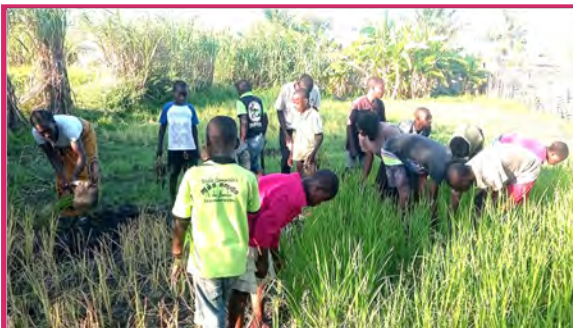
This photo shows the teenage boys and girls being taught to work the land and plant rice in the orphans' field at ACPO. The same field is used for vegetables at another time and has banana trees and sugarcane on its sides.

The same field is used for vegetables at another time and has banana trees and sugarcane on its sides.