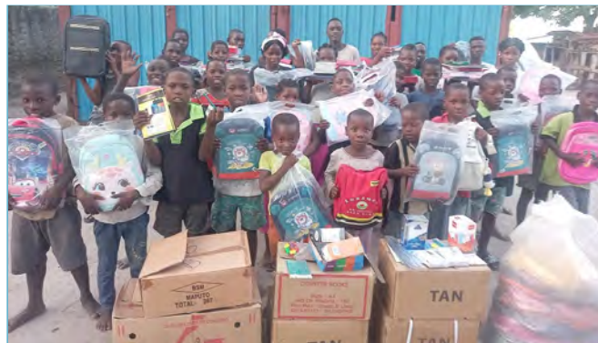
The children are saying a happy thank you for the school bags and school supplies donated through TCF Mercy along with Harvest Community Church.

The same field is used for vegetables at another time and has banana trees and sugarcane on its sides.