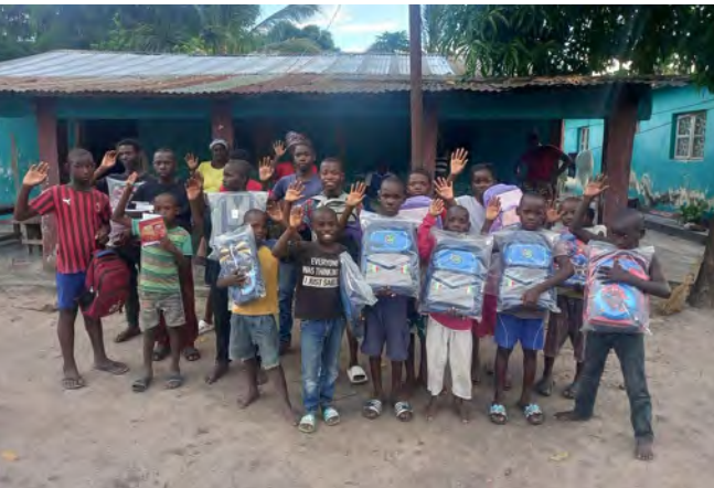
The children rejoicing as they happily receive what they need for school. Thank you!