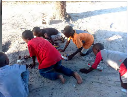
These boys are playing with cars made with plastic bottles. The wheels are made from the lids of the bottles.